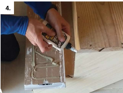
4. Glue beveled edges of finished stair parts and apply adhesive to backside of riser